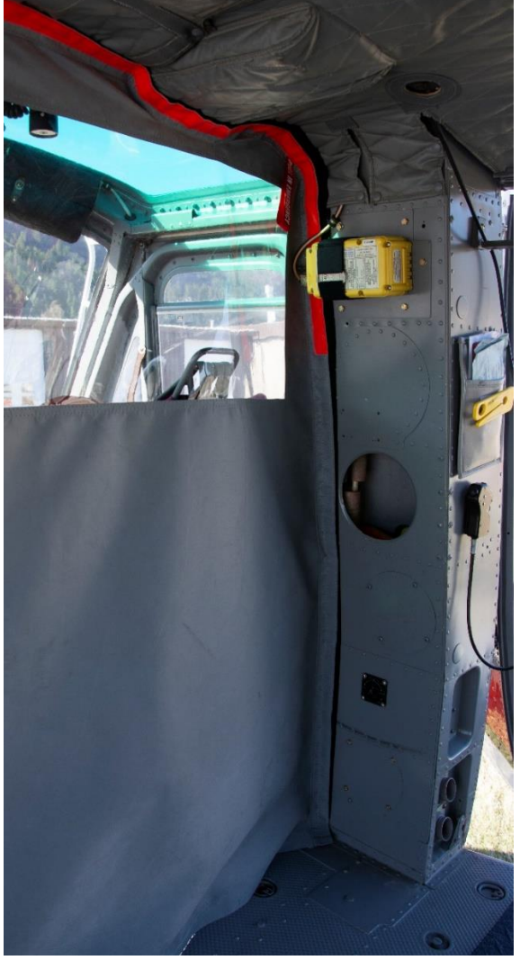
Figure 5 LHS Crew Barrier, Assy (Item 1) Shown