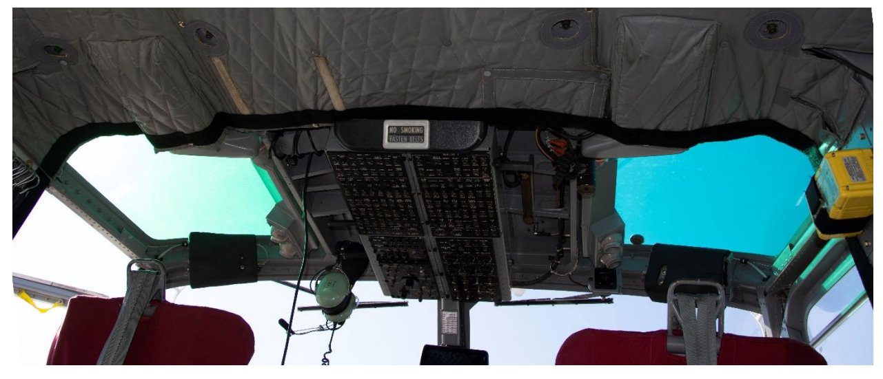
Figure 3 Roof Velcro, Detail (Item 2) Shown

7. With the roof blankets removed and placed on a table. It is permissible to trim the Velcro, Detail (Item 2), into several segments to minimize gaps between it and the blankets especially in the area of the air inlet ducts.