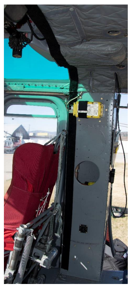
Figure 2 RHS Velcro, Detail (Item 2) Shown