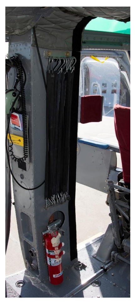
Figure 1 LHS Velcro, Detail (Item 2) Shown

The method shown in the following instructions should be considered optimal, but variation to accommodate existing aircraft configurations are permissible.